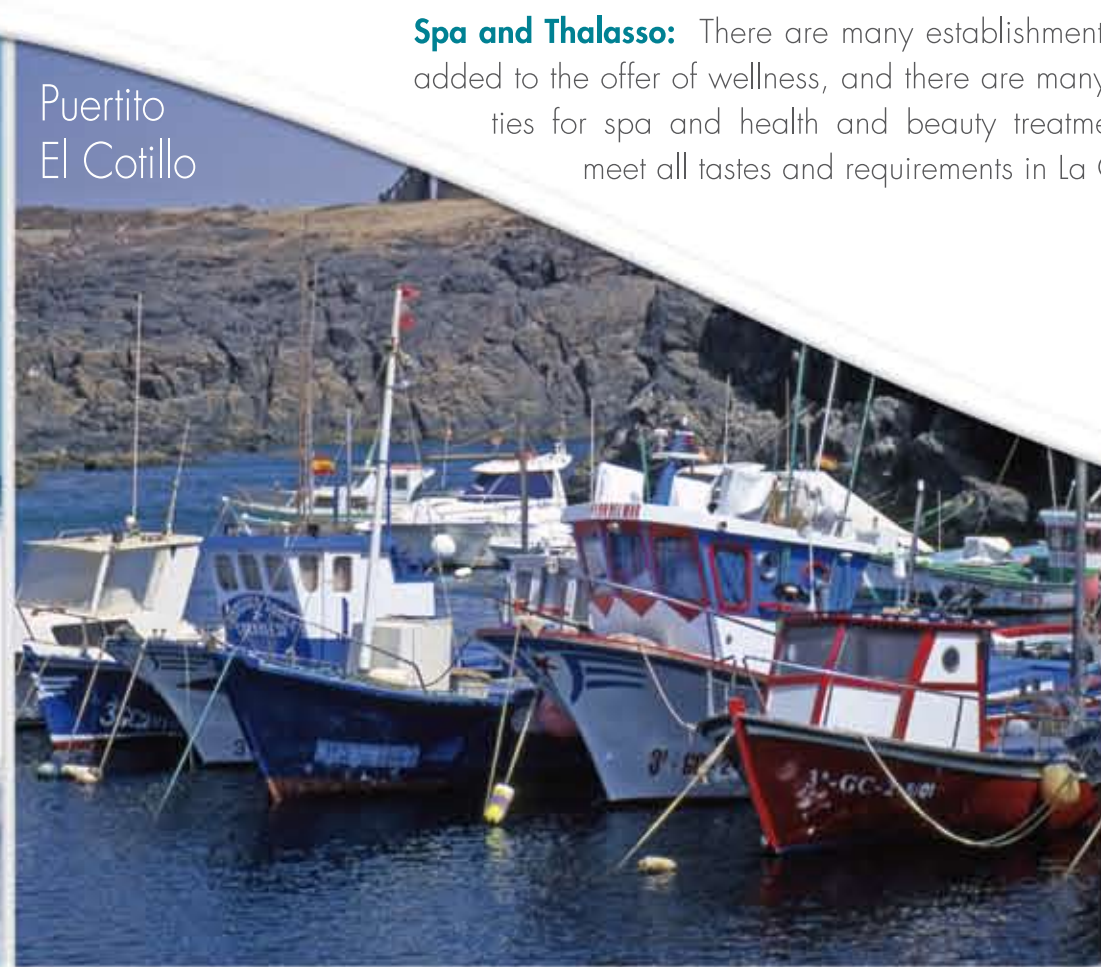
Puertito El Cotillo