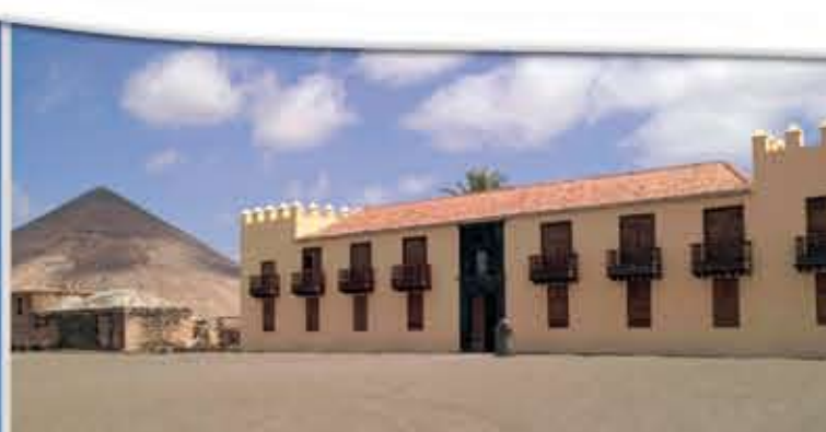
Casa de Los Coroneles