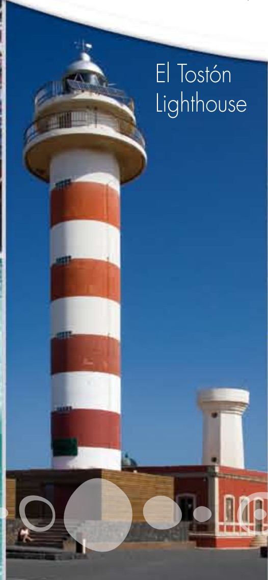
El Tostón Lighthouse