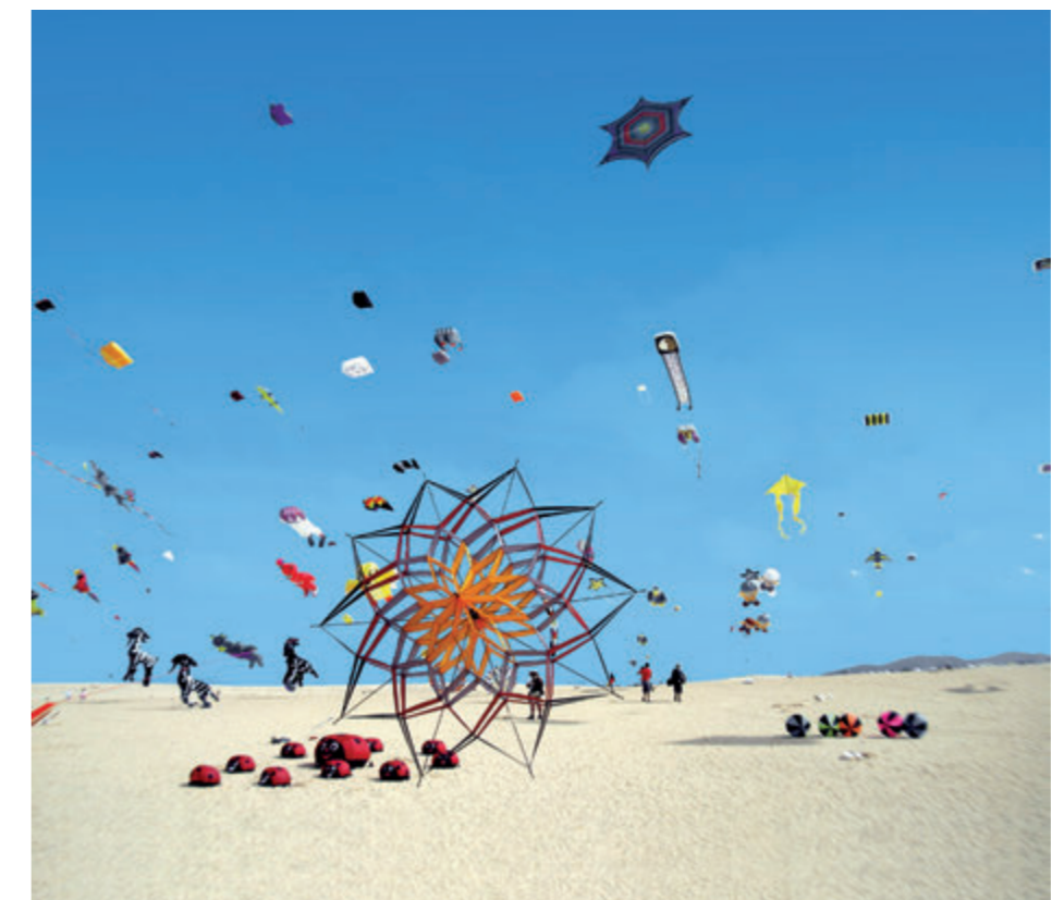
1. The Dunes of Corralejo Natural Park