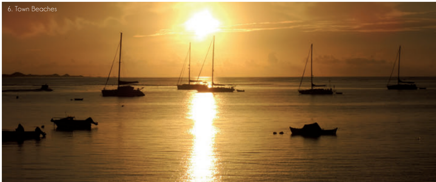
6. Town Beaches

Corralejo, to the north of Fuerteventura, is a modern, dynamic town that is marked by its wild surroundings, its unique geography, the warmth of its climate, and its colours. You can enjoy long, beautiful beaches in Corralejo with crystal-clear water, fine sand, shallow depths, sun, and a wide range of options. The Dunes of Corralejo Natural Park has views of the islands of Lanzarote and Lobos and will transport you to another continent. Corralejo and sport go hand in hand, it has everything you could need to enjoy any water sport, sailing, fishing, surfing, windsurfing, kitesurfing... It also has a surprising atmosphere both by day and by night, where any lifestyle can blend in.